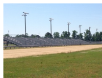
The grandstands at the back track seat more than 3,500.

For large events there are plenty of bathrooms and ticket booths are available for use if charging admission. An abundance of gates allows easy access to the grounds. Thinking car show or animal event? Our track and Livestock Building are already equipped to handle your needs. Plus with your rental you will receive free online advertising for your event on the Robeson County Fair Web site. Camper sites are also available with power and water hookup. Please talk with our manage about rates.