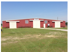
Equipped with stalls, cages, and showing ring this is the premier building for animal events.

The Robeson County Fair Grounds is an ideal venue for your next group event. Whether a birthday party or concert consider hosting your event at this location. Located on Highway 41 just off of Highway 74